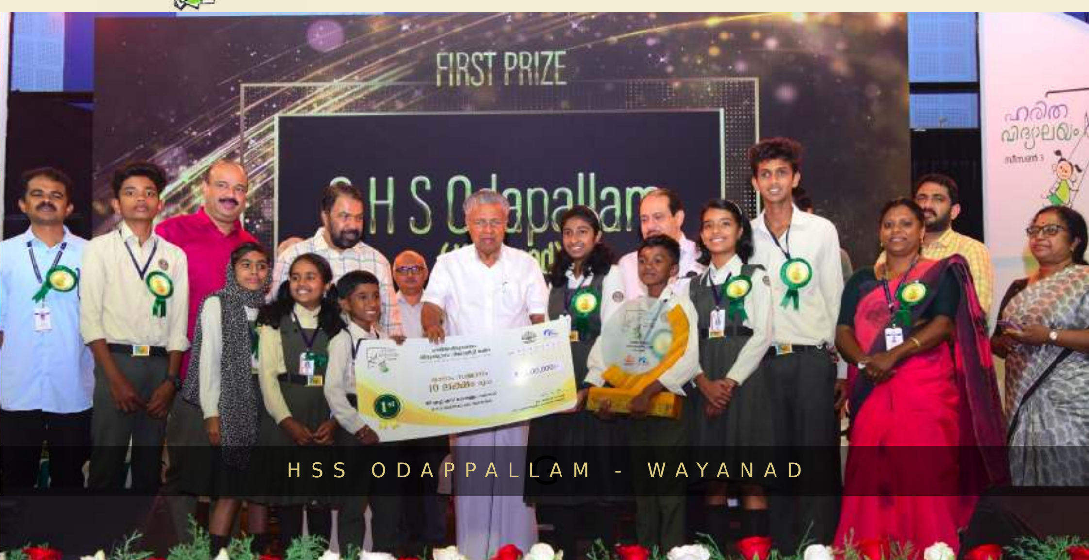
HSS ODAPPALLAM - WAYANAD