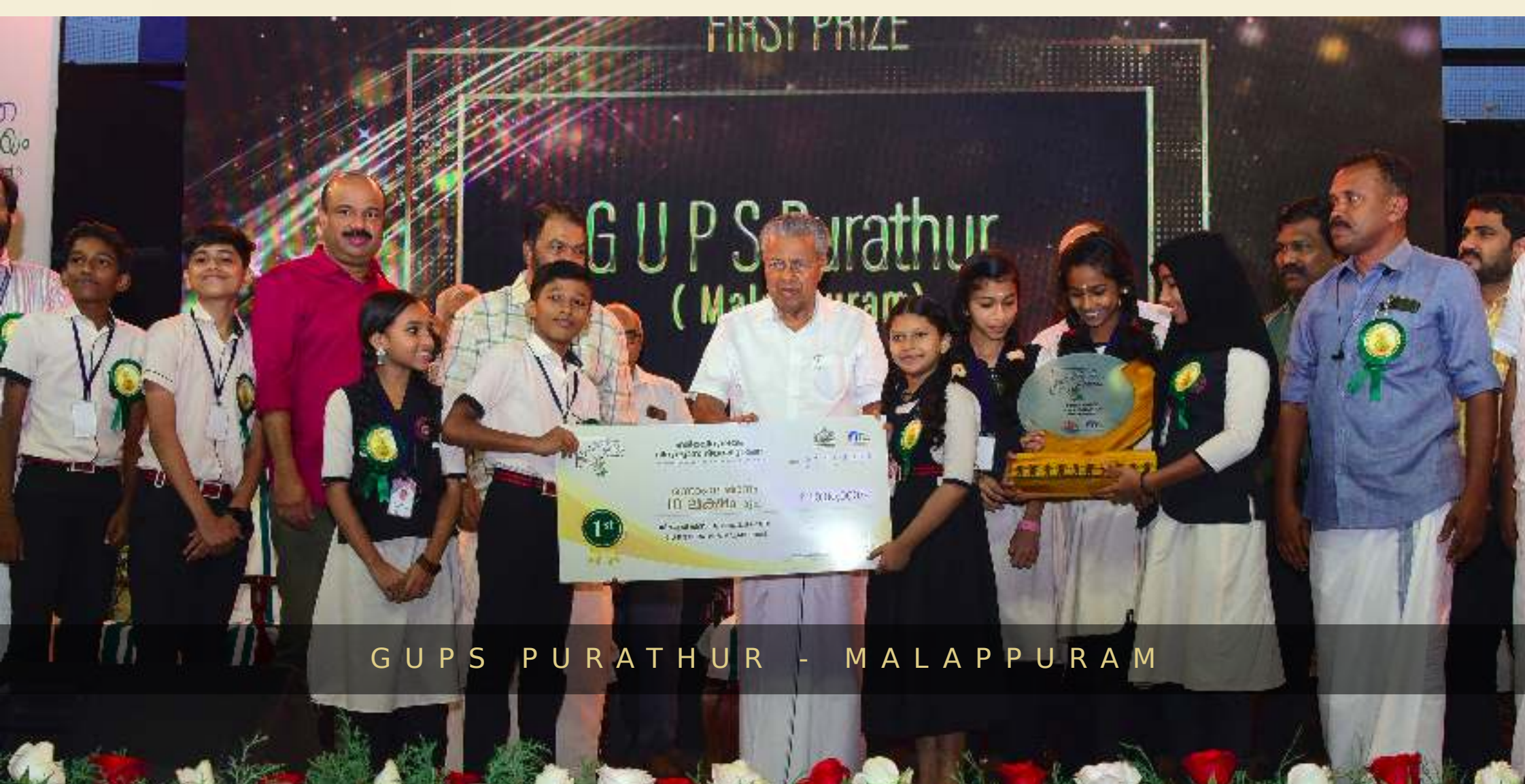
GUPS PURATHUR - MALAPPURAM